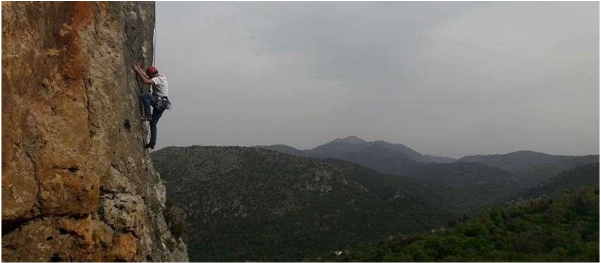
Image 9: Lykourgos Polychronopoulos on the route «Master Oogway», 6a, Kakavo, 2017.

Mount Parnon's Summit, Megali Tourla, in the background.