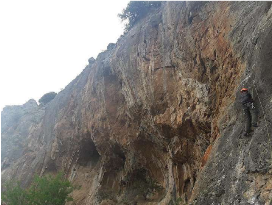
Image 12: Konstantinos Neokleous on the route «Dharma», 6a+, Kakavo, 2017