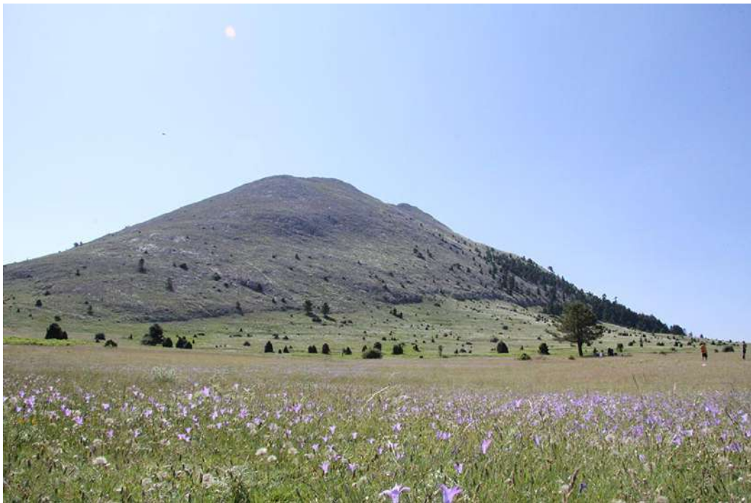
Image 14: The spring blooming Mount Parnon plateau and Megali Tourla, the mountain's Summit