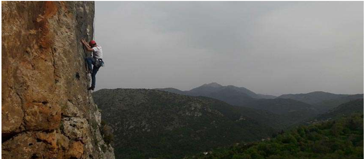
Image 9: Lykourgos Polychronopoulos on the route «Master Oogway», 6a, Kakavo, 2017.

Mount Parnon's Summit, Megali Tourla, in the background.