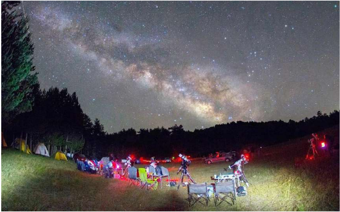
Image 13: The annual «Astroparty» outside the mountain hut of Parnon, July 2016