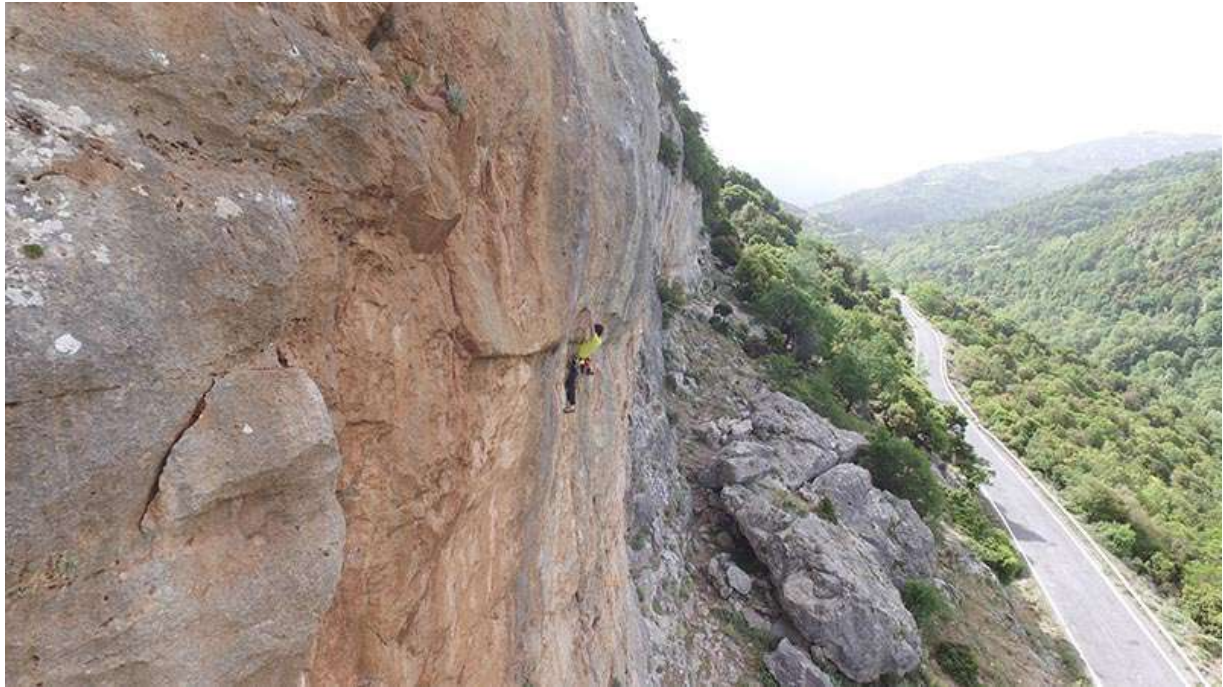
Image 1: Thanasis Kefalas on the route «Giorgos Pappas Extension», 7c, Zonaga, 2017